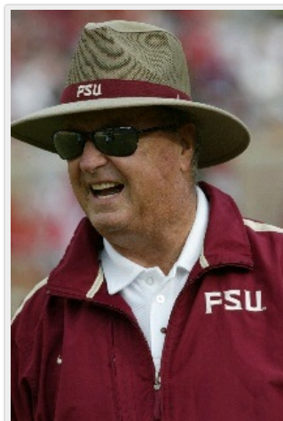
Will Bobby stay after this year?

What does it mean for the Gators? Recruiting gets a little easier for Urban Meyer with Bowden out of the picture. Any players that wanted to play for a legend will turn their heads down-state to Gainesville. In my opinion, a legend-in-the-making is better than a legend enjoying his twilight years. How many more years of Gator domination do you think we'll see - with or without Bowden? A five-year deal for Jimbo plus another four to five years for his replacement means a decade of owning FSU. Maybe UF can just drop them from the schedule.