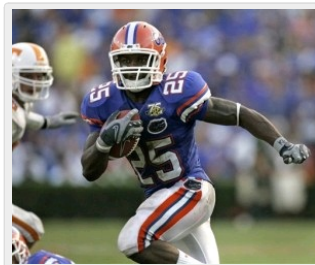
Will UF special teams score?